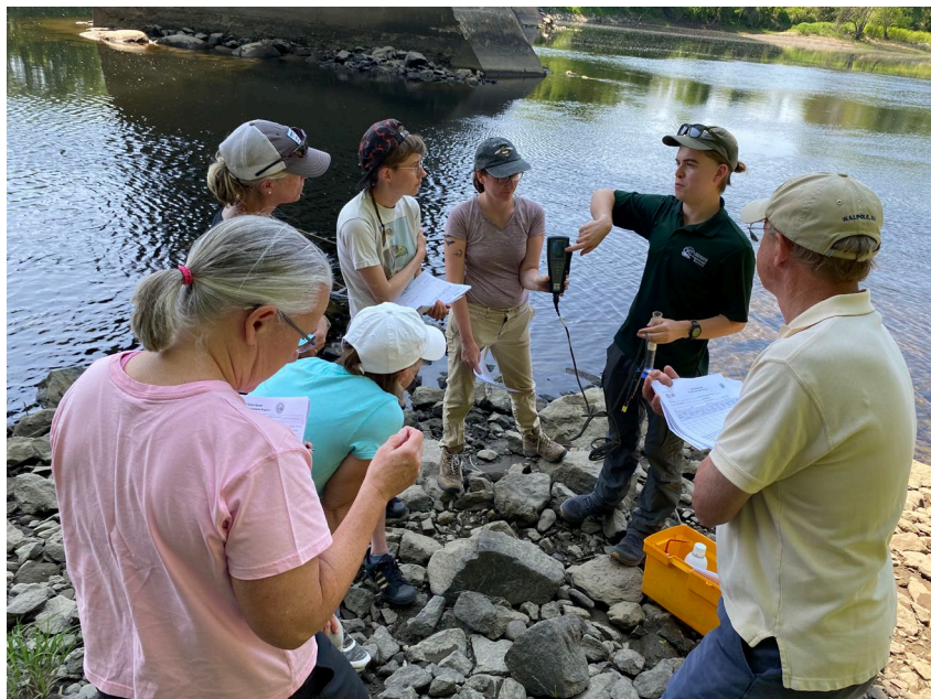
Wantastiquet region volunteers receive training from NHDES staff on water quality equipment, Walpole, NH, 2023.

Guided by this mission, the CRJC strives to help guide proposed watershed activities by initiating, reviewing, and commenting on a wide variety of projects and regulatory proposals such as shoreland protection, energy issues, and clean water initiatives. Commissioners and the local representatives are all united in a shared regard and reverence for the Connecticut River, the surrounding landscape, and the regional ecosystem. This spirit allows them to appreciate successes over the past century, and to identify and share efforts for responsible stewardship into the future. With its full commissions board and its five Local River Subcommittees (LRS), more than 60 volunteers regularly engaged in the CRJC mission during Fiscal Year 2023 (FY23) or July 1, 2022 through June 30, 2023.