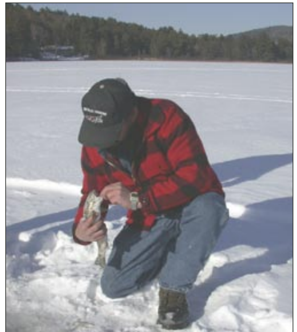
A fisherman examines his catch. River sampling found a good oxygen supply to meet the demand of fish such as this brown trout.