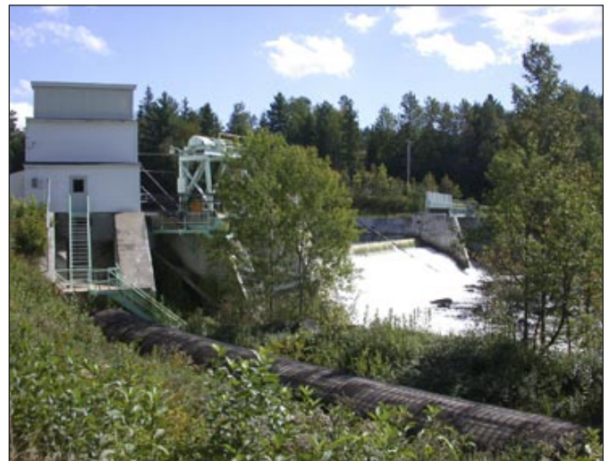
Canaan Dam and its historic wood stave penstock between Canaan and Stewartstown, a few miles from the Canadian border. The dam is up for relicensing.

CRJC's Headwaters Subcommittee is advising on local conditions and needs, and will meet with a PSNH representative in March. 🌿