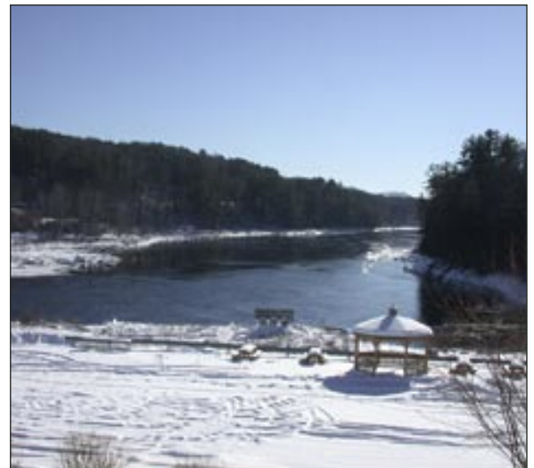
Eagles spend many winter days perched in the pines at right, surveying open water below Wilder Dam.